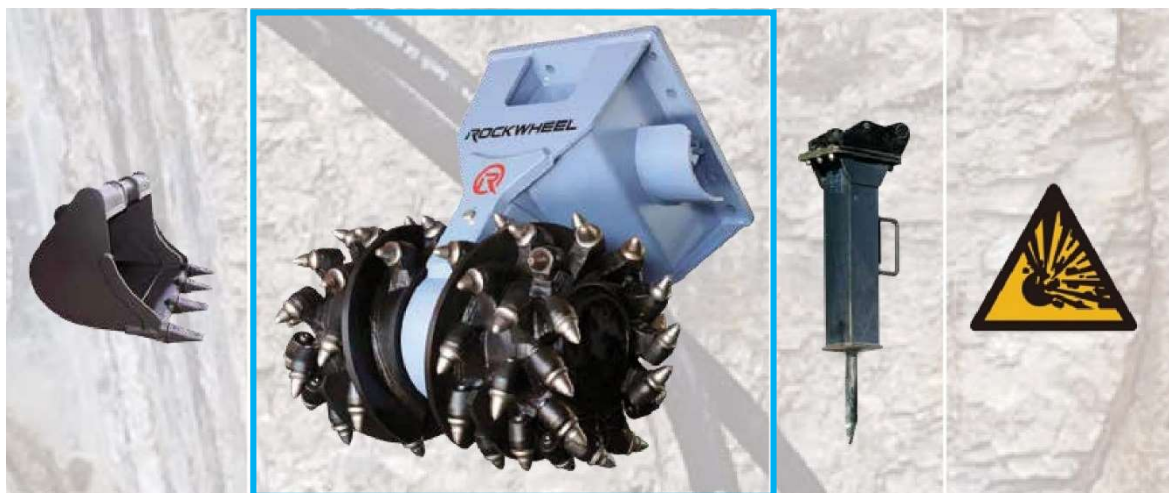
0 - 5 MPa バケット等